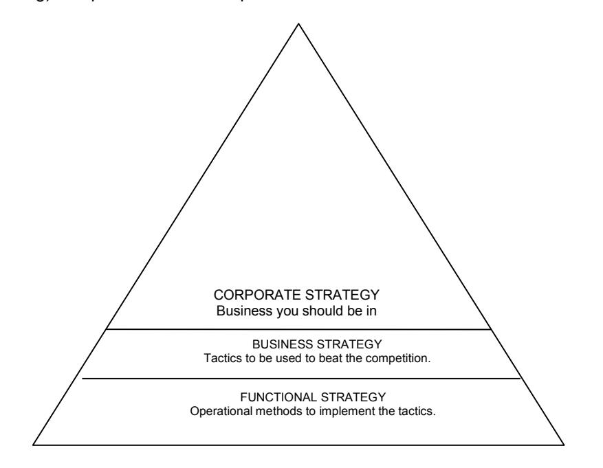
Fig. 1. The enterprise strategy Source: Vadim, (2007)