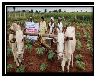
Fig. 3. Pocketing of fertilizers (T 2 )

The fertilizer applicator was made up of cone in which fertilizers is poured, it is tied to cattle pair. It has small pipes which were applying fertilizers exactly at place needed (5cms away from plant) on both sides and an adjustable valve to adjust the fertilizer quantity. This was developed by a farmer at Wyra. The innovative idea of farmer which is low cost technology Rs 2500/ applicator was studied for its efficiency.