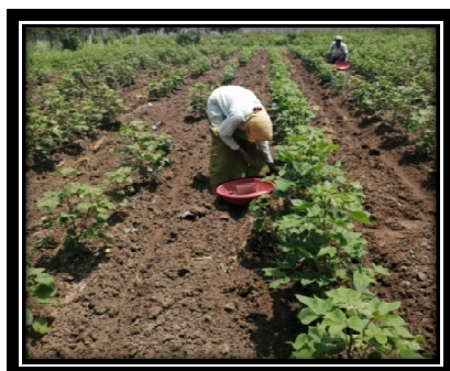
Fig. 2. Pocketing of fertilizers (T 1 )