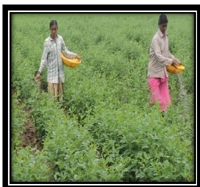
Fig. 1. Broadcasting of fertilizers (FP)

The farmers involved in cultivating Castor, cotton, Redgram and Chillies with cattle pairspraying fertilizer in their fields were selected and was conducted in two districts of Telangana state of India. Warangal district from central Telangana zone and Nagarkurnool district of southern Telangana zone was selected. A Sample size of sixty farmers and farm women n=60 were selected, n=30 from each district. Three methods of applying fertilizers were studied Farmers Practice (FP) means broadcasting the fertilizers as shown in Fig. 1, T 1 means pocketing of fertilizers as shown in Fig. 2 and T 2 means using the fertilizer applicator shown in Fig. 3.