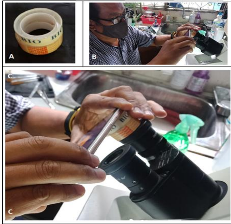
Fig. 1. A. small sized cello tape used as an external adaptor-like for the smartphone. B. Setting the smartphone so that it can rely on the cello tape. C. Left hand can hold the smartphone, and with the free right hand can adjust the microscope settings (e.g. aperture for light), and after the best image seen, the right hand's finger can push the button of the camera