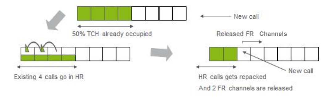
Fig. 3. Presentation of a series of call channels

The reason and solution are High TCH Traffic/High Utilization/TCH Congestion, Low Availability, Hardware Faults, Transcoder Congestion, ABIS Congestion, Poor coverage, Check TACSR, Check Data Usage & FPDCH definition and TRX Performance check. All the points (1 to 5) are discussed in the TCH Congestion KPI so please refer the points explained above. Besides that some other factors are also there which may cause the Degradation of TASR.