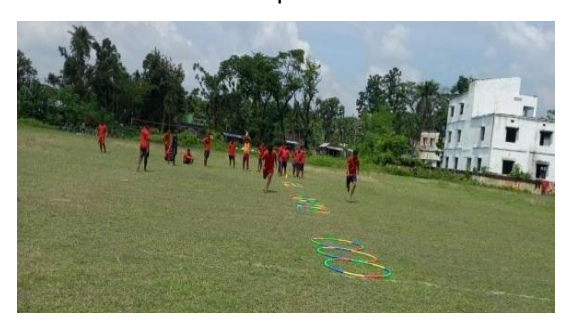
Pic. 5. Sprint at the given rhythm test - rhythm ability

A Rhythm ability was measured by sprint at the given rhythm test and was scored as difference between the timing of the first and second attempt was taken as a score.