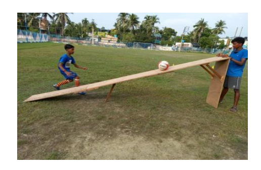
Pic. 3. Ball reaction exercise test - reaction ability