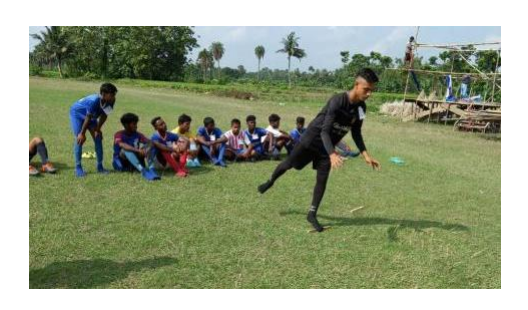
Pic. 4. Bass stick balance test - balance ability

A Rhythm ability was measured by sprint at the given rhythm test and was scored as difference between the timing of the first and second attempt was taken as a score.