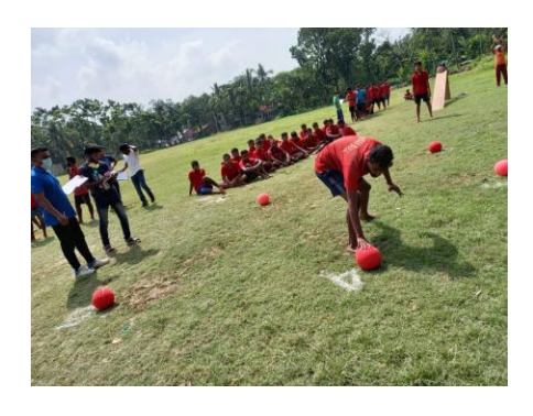
Pic. 1. Numbered medicine ball run test - orientation ability

▲ Orientation ability was measured by numbered medicine ball run test and was recorded in 1/100th of second. Three trials were given and the best was recorded as the score.