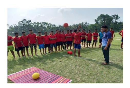
Pic. 2. Backward medicine ball throw test - differentiation ability

▲ Differentiation ability judged through 1kg medicine ball touching the mat- 1 point, 1 kg medicine ball touching the circle line- 2 points, 1kg medicine ball touching inside the circle-3 points, 1 kg medicine ball touching the 2kg medicine ball – 4 points and was recorded in points.