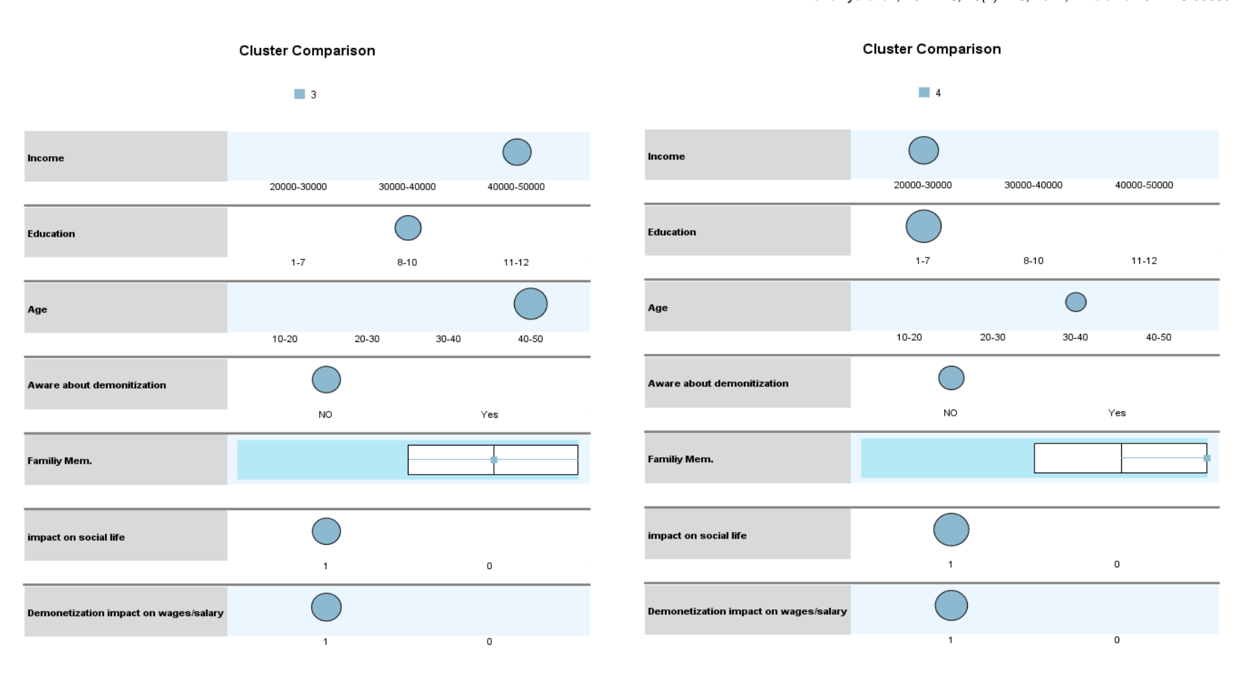
Fig. 2. Showing perceptual segmentation of different variables and their impact on criterion variables