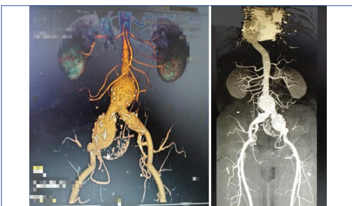
[Table/Fig-4]: CT aortogram showing saccular aneurysm of bilateral common iliac arteries and infrarenal abdominal aortic artery aneurysm.

arteries and infrarenal abdominal aortic artery aneurysm [Table/Fig-4]. CT angiogram showing fusiform aneurysm of the distal abdominal aorta [Table/Fig-5].