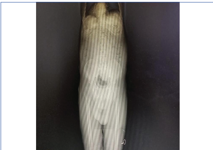
[Table/Fig-3]: X-ray showing left-sided hydrocele with the marked swelling.

arteries and infrarenal abdominal aortic artery aneurysm [Table/Fig-4]. CT angiogram showing fusiform aneurysm of the distal abdominal aorta [Table/Fig-5].