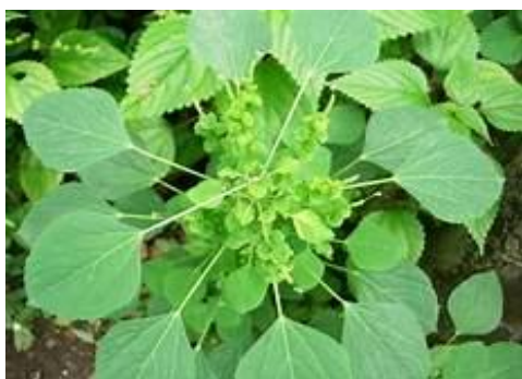
Fig. 1. Acalypha indica Linn. [5]