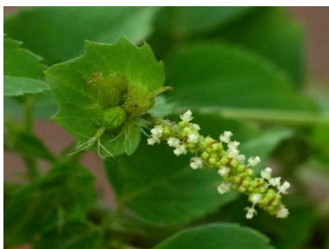
Fig. 2. Acalypha indica flowers [6]