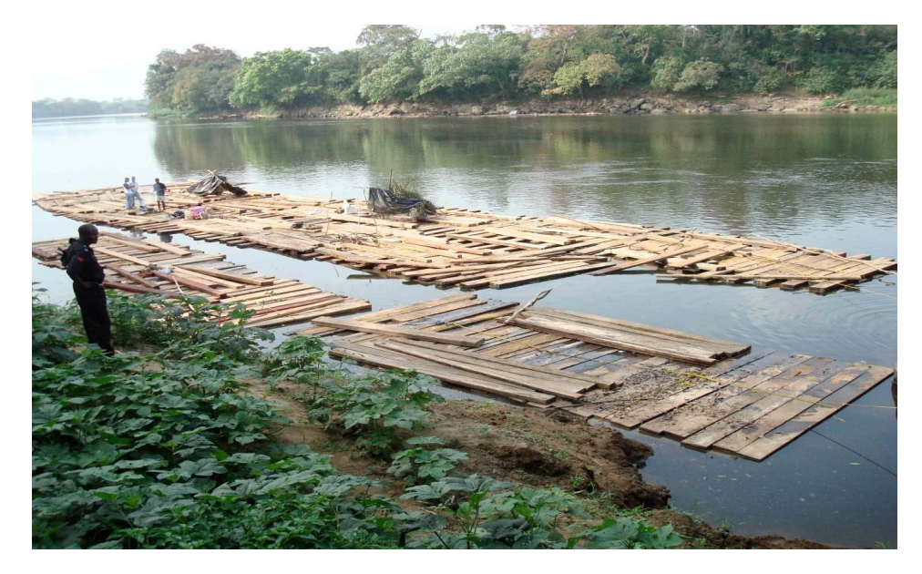
Plate 1. Illegal timber floated along the Cross River, impounded by taskforce, during the ban on logging

taskforce, whose responsibility was to enforce the ban, also had some of her members who became timber merchants, collaborating with illegal timber dealers hence, further encouraging illegal logging [15,19]. The head of the defunct Anti-deforestation taskforce, during field discussion, stated that "He led a taskforce where