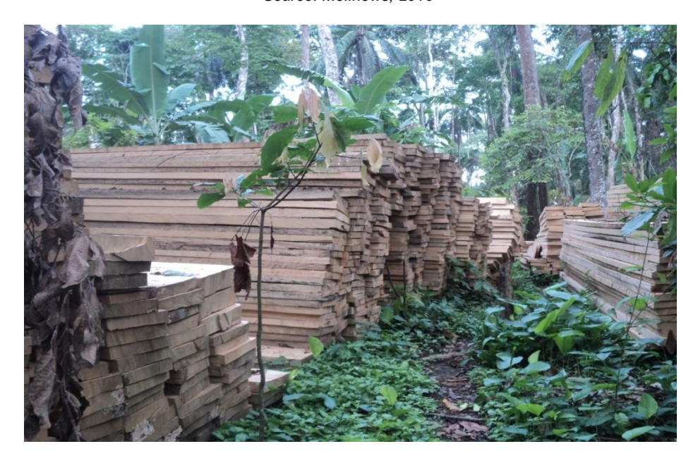
Plate 2. Illegally sawn wood stacked in the forest, ready for evacuation by illegal loggers, during the ban on logging