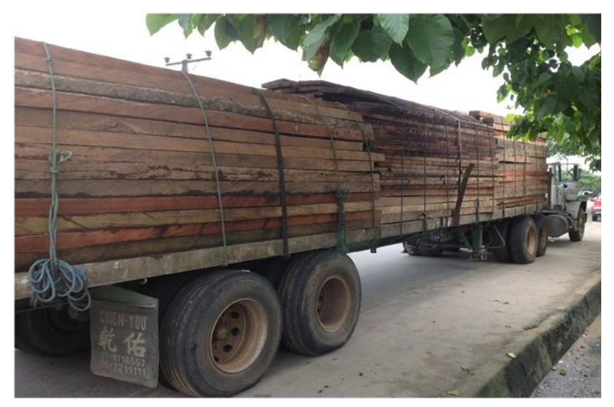
Plate 3. Truck of illegally sawn wood, impounded in Cross River State new secretariat, Calabar, during the ban on logging

constituted by the current administration, their activities and impacts are yet to be ascertained. Corruption associated with ban on logging is not isolated to Cross River State alone. Countries/regions under ban on logging have been characterized by increased corruption [20,7].